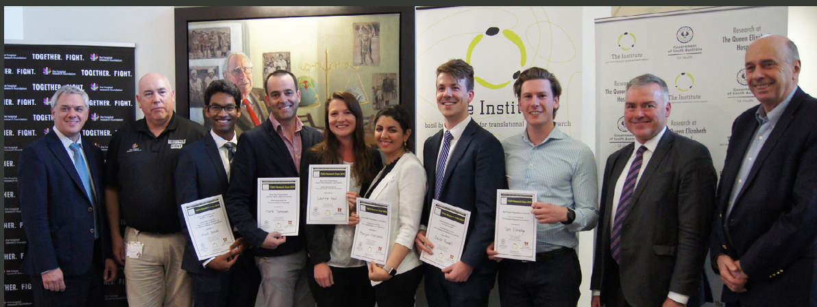
2019 Award Presentation

Basil Hetzel Institute, The Queen Elizabeth Hospital, Woodville South