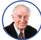
Prof Peter Doherty Doherty