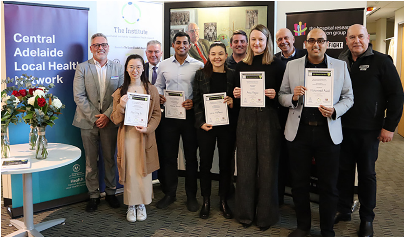
30th TQEH Research Expo Award Winners: