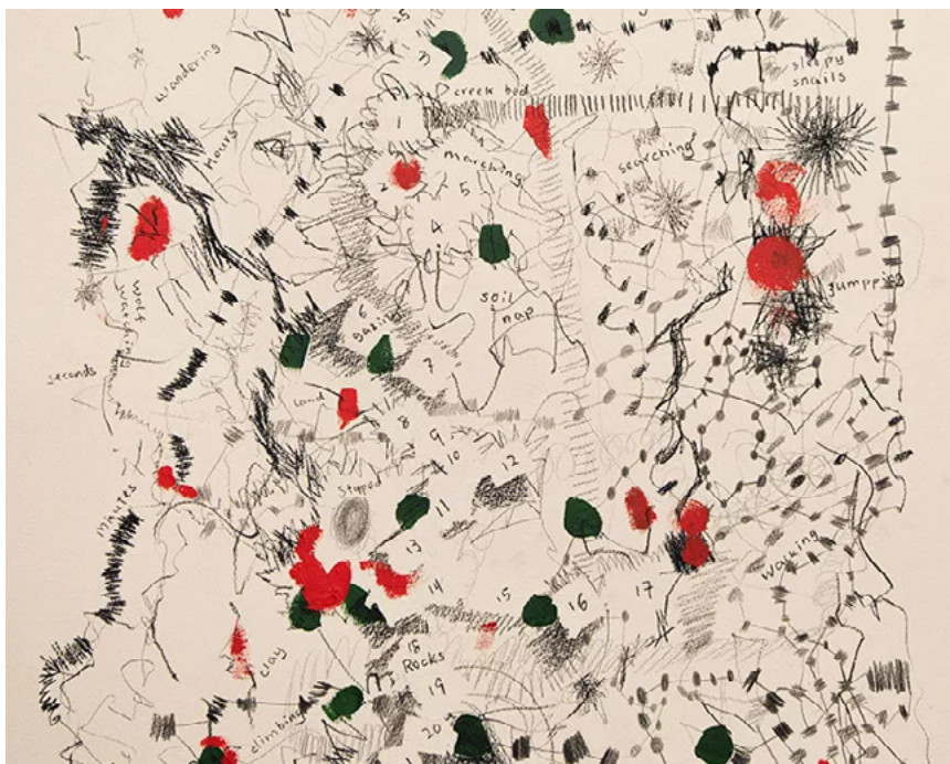
Jingwei Bu, 'Life Maps – Wandering in Memories of 4 years Old Crossed the Creek Found Wild Berries Sleepy Snails' (detail), 2021, pencil and acrylic on paper as an outcome of time-based performance. 88 x 68cm.

There's a new Centre for Creative Health (CCH) Gallery at The Queen Elizabeth Hospital (TQEH), which will be on display until 14 July 2022.